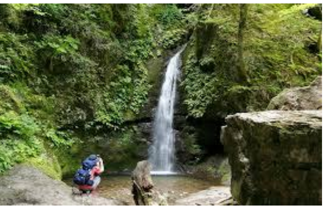
Rock Garden (ロックガーデン) 35 minute walk to reach the rock garden along the clear stream.

A 20 minute hike will bring you to this waterfall.