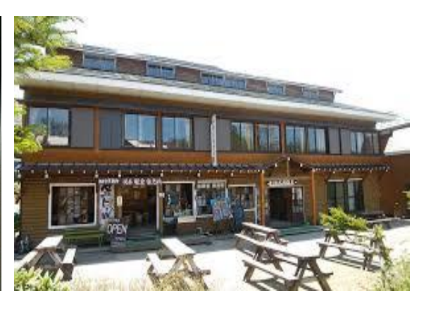
Miharashi Hinoemata hut