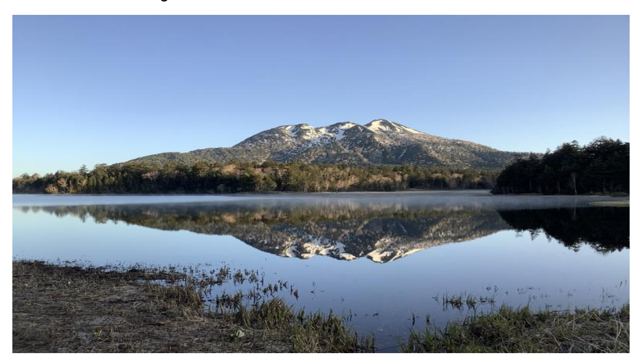
In the Ozenuma area, there is a visitor center, a Nagakura hut, and Ozenuma Hutte, and there is a campsite behind the Hutte.