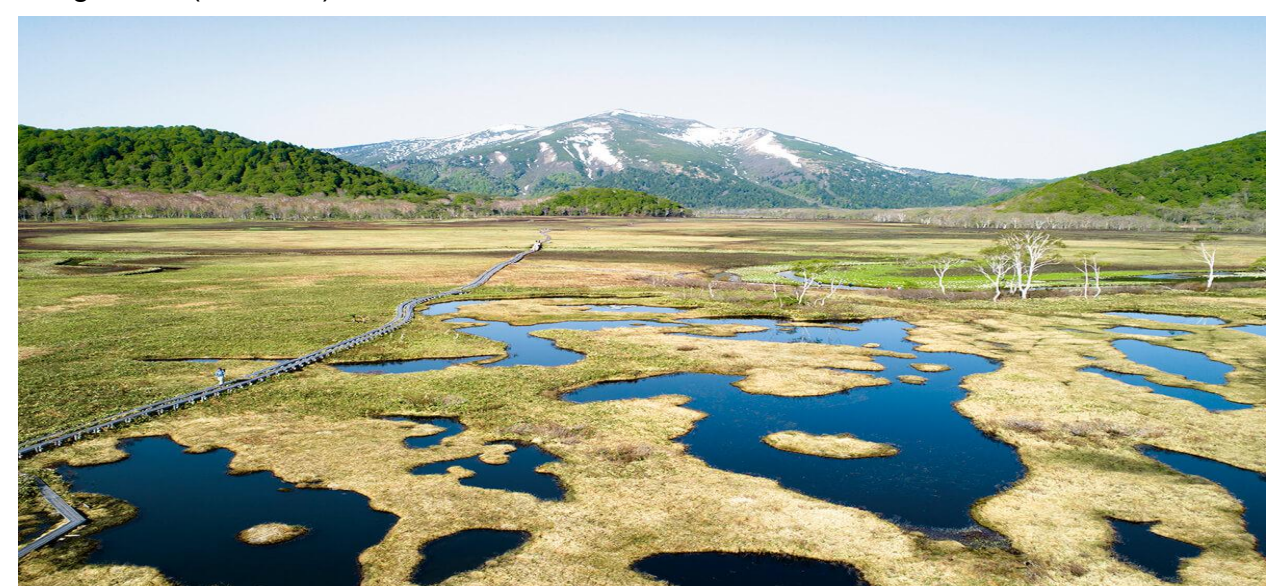
Miharashi district located in the center of Oze